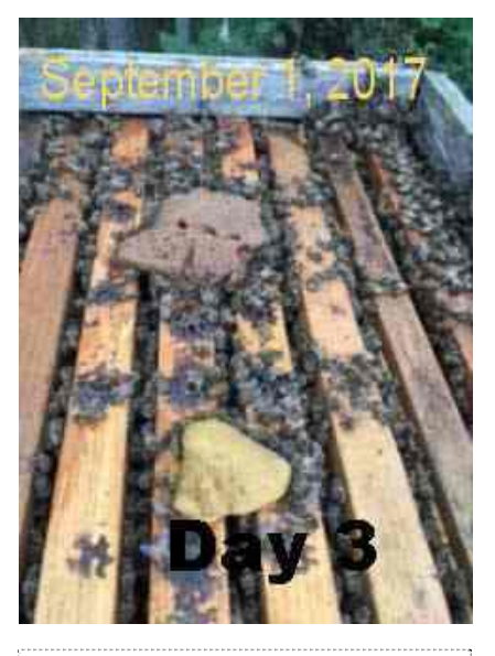
<u>Day 3:</u> Bees continue to consume both protein patties.