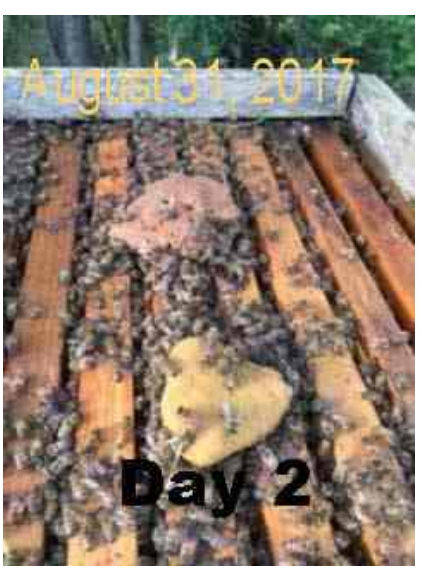
<u>Day 2:</u> Bees consuming both protein patties.