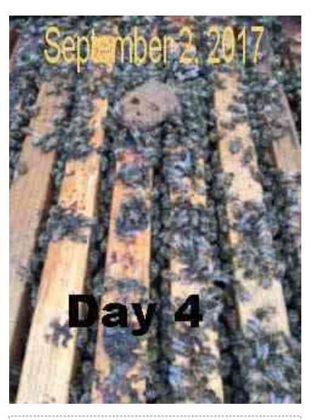
<u>Day 4:</u> AP23®/HBH™ protein patty completely consumed by bees. Approximately 1/3 of HBH™ only patty remains.

NOTE: This test was started late August with the bees continuing brood rearing up to and including November. There is usually no brood in this region at the beginning of October.